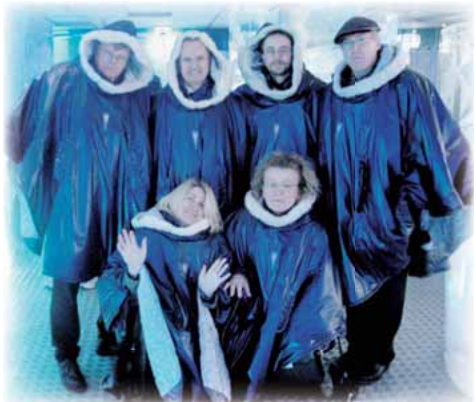
Once in a while in a different environment: Members of the Executive Board and their Swedish hosts at the Icebar in Stockholm city centre.