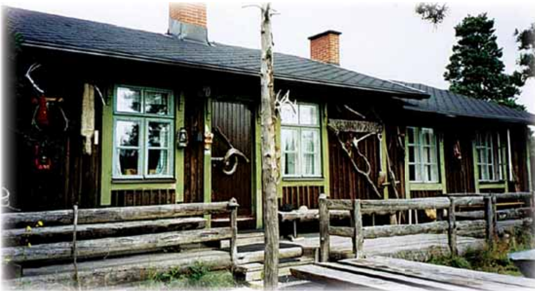
A peat balneology round table meeting will be held in September 2010 at Reino's Cottage in Kurikka, Finland.

also members of the Finnish Peatland Society during the 60th Anniversary Excursion to balneological sites in Western Finland during 14 - 16 September 2009.