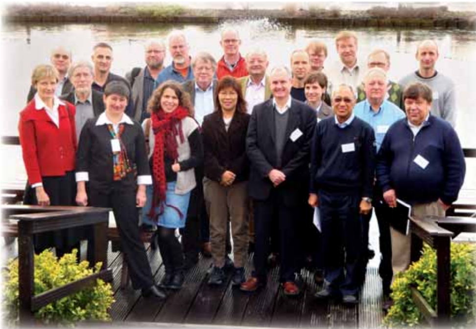
The most important project for IPS in 2009 was the Strategy for Responsible Peatland Management. A group of peat and peatland experts interested in this work met for the first time in Amsterdam in February 2009 to draft the Strategy.

The book "Peatlands and Climate Change" was one of the most significant products of the IPS in 2008 and 2009. By December 2009, 407 copies of the book were sold, most of them via the IPS online shop. Climate change and greenhouse gas