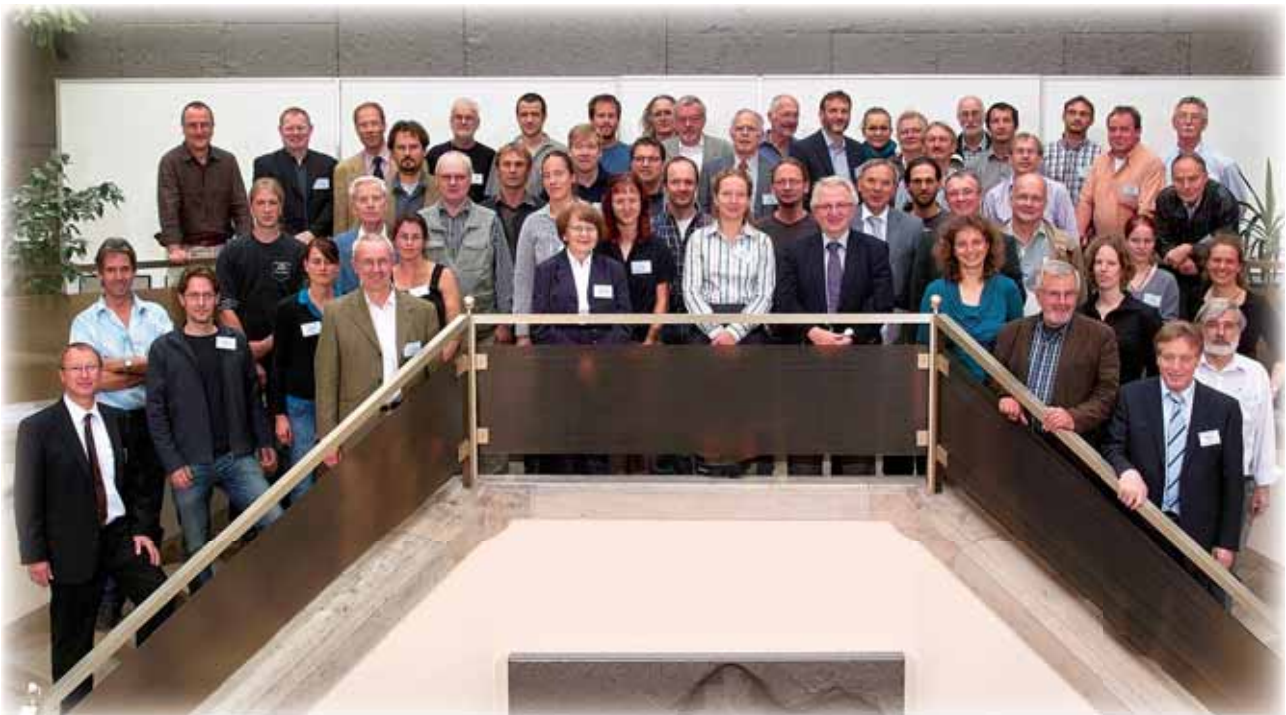
The German National Committee is the second largest of the IPS.

The 3rd Symposium “Peat and Humic Substance Preparations in Medicine, Veterinary Medicine and Body Care” took place in Bad Langensalza, Thuringia on 26 - 28 May 2009. Within a national scope, the symposium gave room to 30 participants coming from research and practice to present findings and to inform about current tendencies in the field of peat and humic substance preparations. The topics were diversified, from process engineering of peat conditioning, bio-compatibility assessment of isolated humic substance fractions and the development of a peat mash bandage in the 19th century, up to the vision of a photo-protective lipstick based on peat. Manufacturers of peat and humic substance preparations presented their products, but a further important task was to intensify networks between industry and science in the field of peat and humic substances and to find suggestions for co-operation. Two peatlands being in revitalization have been the object of a guided