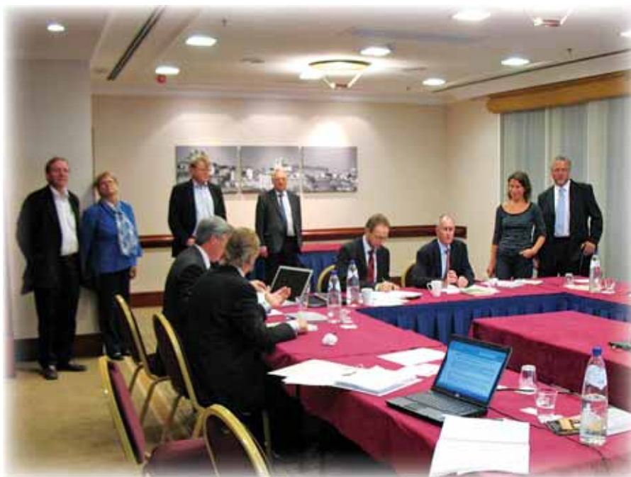
The Scientific Advisory Board of IPS, consisting of the Commission Chairs and the 2nd Vice President, met twice in 2009 - here together with the Executive Board in Brussels.

The IPS Commission I embraces inventory, stratigraphy and conservation of peatlands. Included in this context are ecology, geology, hydrology, biology and terminology. Each of these subjects could constitute a working group. A perspective is to achieve new activities within the working groups, while keeping in mind collaboration with other Commissions.