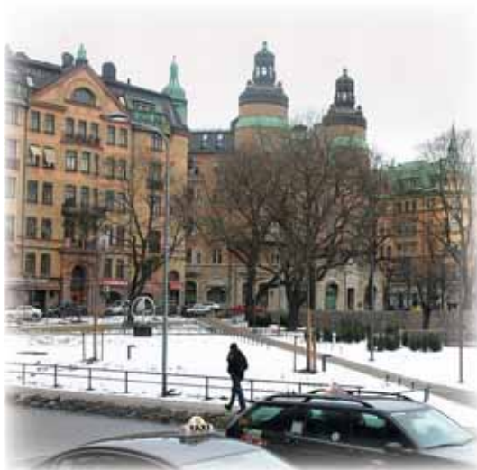
Stockholm in winter - surely this will look much better in summer 2012!