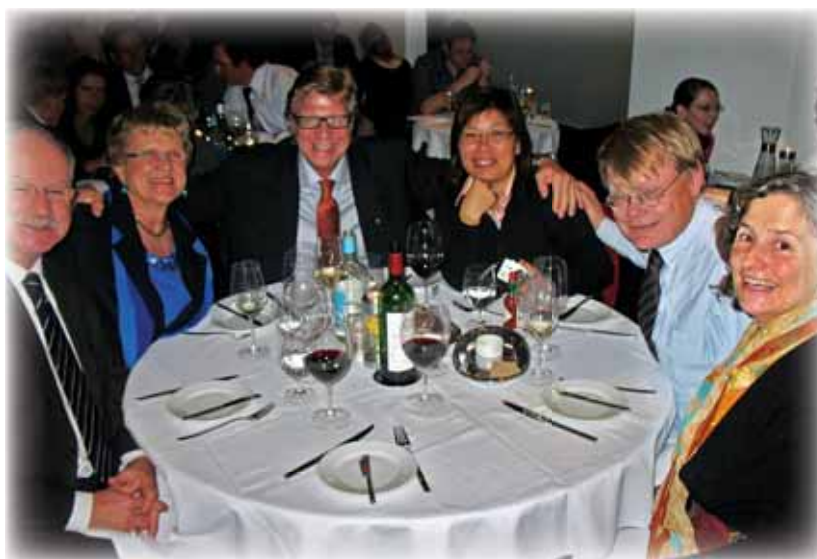
Besides meetings, the attendees of the Annual Assembly also knew how to enjoy each other's company.

on becoming a new IPS Honorary Member in 2009.