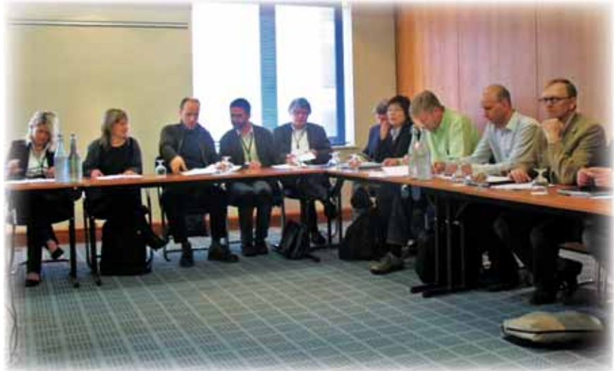
The Strategy for Responsible Peatland Management was edited at workshops in Amsterdam, Belfast and Brussels and further developed through email comments from numerous stakeholder organisations and individuals.

Workshops for the Strategy for Responsible Peatland Management were held in Amsterdam during 13 - 15 February 2009, in Belfast on 27 - 28 April 2009 and in Brussels on 28 October 2009. Meetings of the IPS Commissions took place in Belfast, Northern Ireland in April 2009.