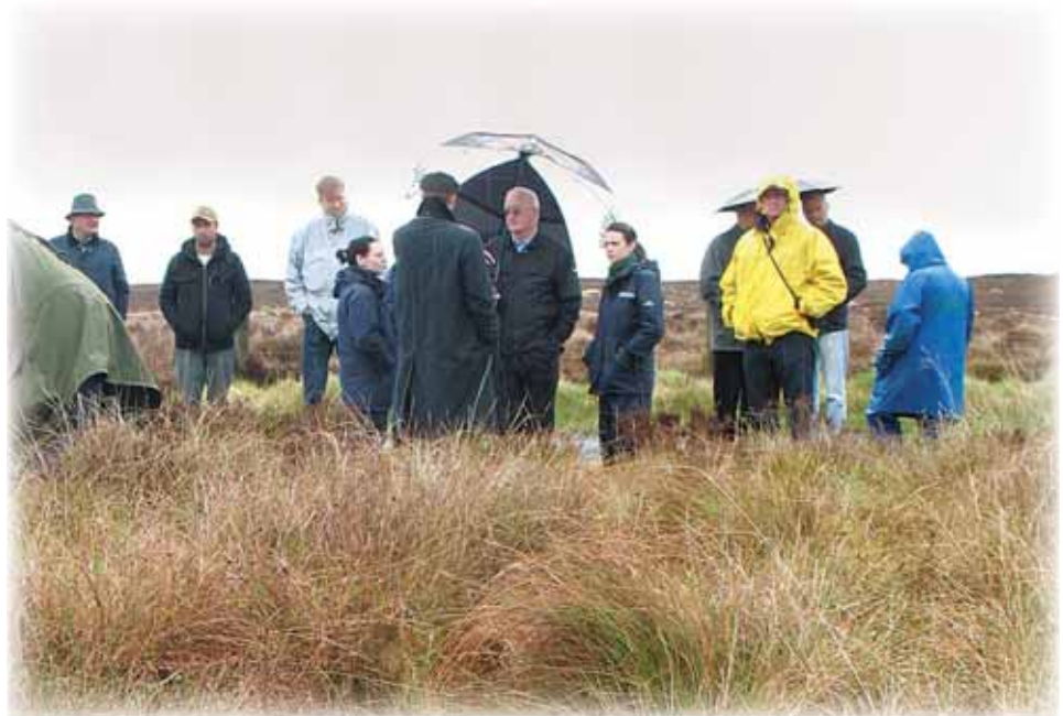
The pouring rain did not harm the enthusiasm of our members.