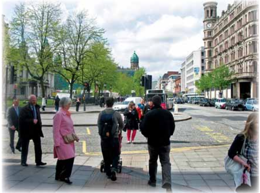
The Annual Assembly 2009 was held in Belfast under the auspices of the UK and Irish National Committees.

The 13th Annual Assembly of National Representatives of the International Peat Society was held in Belfast, Northern Ireland, United Kingdom on 26 April 2009. The Assembly was attended by ten representatives of the National Committees of Canada, Finland, Estonia, Germany, Ireland, Latvia, Malaysia, the Netherlands, Sweden and the United Kingdom. Additionally, twelve observers were present.