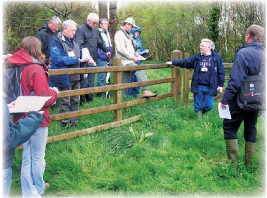
The study tour of the Belfast Convention was a great opportunity to get to know IPS members from the United Kingdom and Ireland.